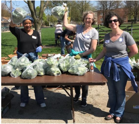
Producemobile Volunteers, June 2018