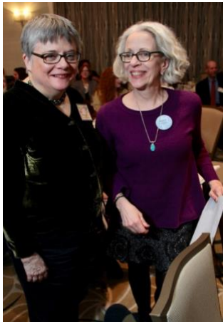
FCCE Delegate (left) received her Vision Keeper award from Board Member and member of FCCE (right) last February at the 2018 Vision Keeper Dinner.

A huge part of IAE's budget is met by volunteer hours and in-kind donations, but IAE depends upon funds raised at the VKD to hire staff (p 17). Please encourage your faith community to name a Vision Keeper and your members to attend the dinner to honor all of IAE's, Vision Keepers.