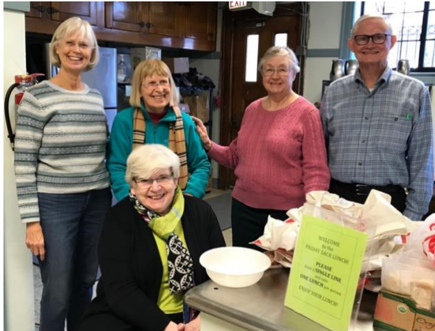
Northminster Sack Lunch soup kitchen volunteers.