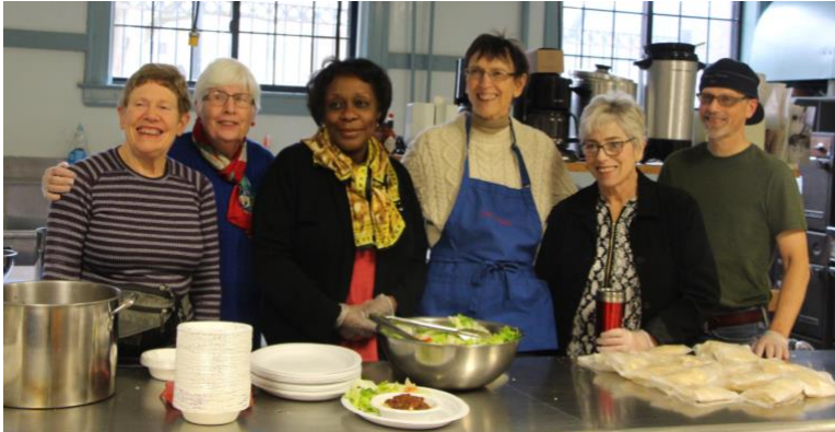
Delegates representing Unitarian, Friends, Sherman, St. Luke's, First Presbyterian and Alice Millar faith communities sponsored a Friday Sack Lunch Soup Kitchen meal.

In the afternoon during early November through the end of March, IAE sponsors centers that provide a warm, safe place for guests to enjoy conversation, reading, light snacks, or a nap. Five churches host the Warming Centers: Bethany Baptist, First Congregational (UCC), First Presbyterian, St Mary Catholic and St. Paul's Lutheran.